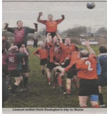
Lineout action from Essington's trip to Stone